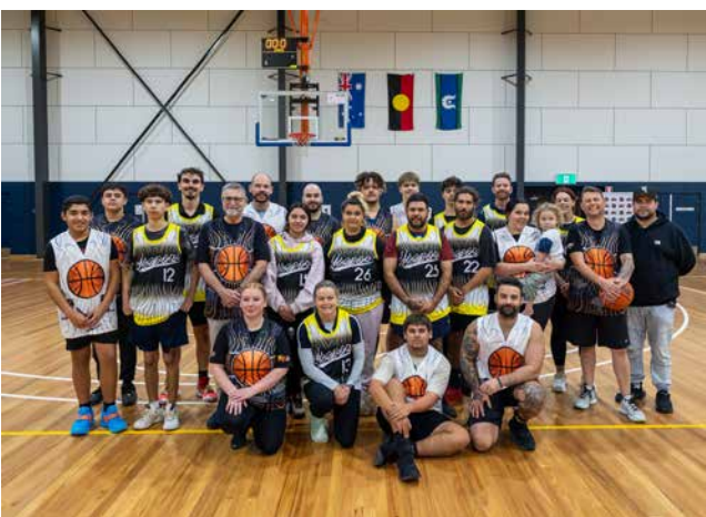
The Deadly Hoops Basketball game brought together the community.