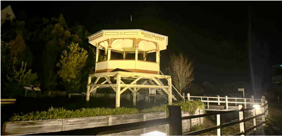
The historic Walhalla Rotunda. Bands would play live music for the town.