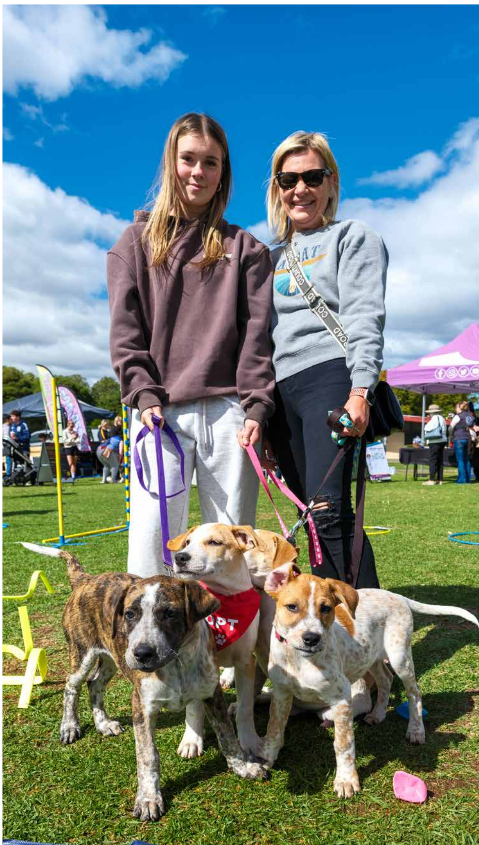
From the 2025 Baw Baw Shire Pet Expo.