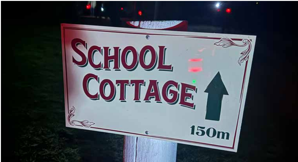
The entrance sign for the school cottage and yard.