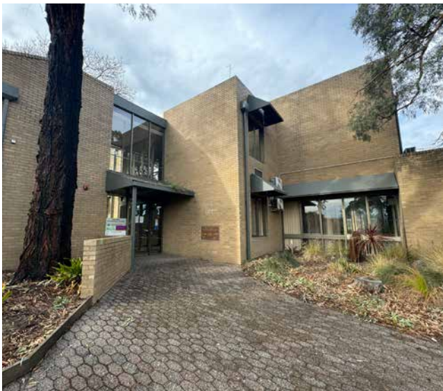
The Trafalgar Business Centre.

The proposal also makes several recommendations to council, including for the council to rescind the decision to sell the building and undertake consultation with the local community.