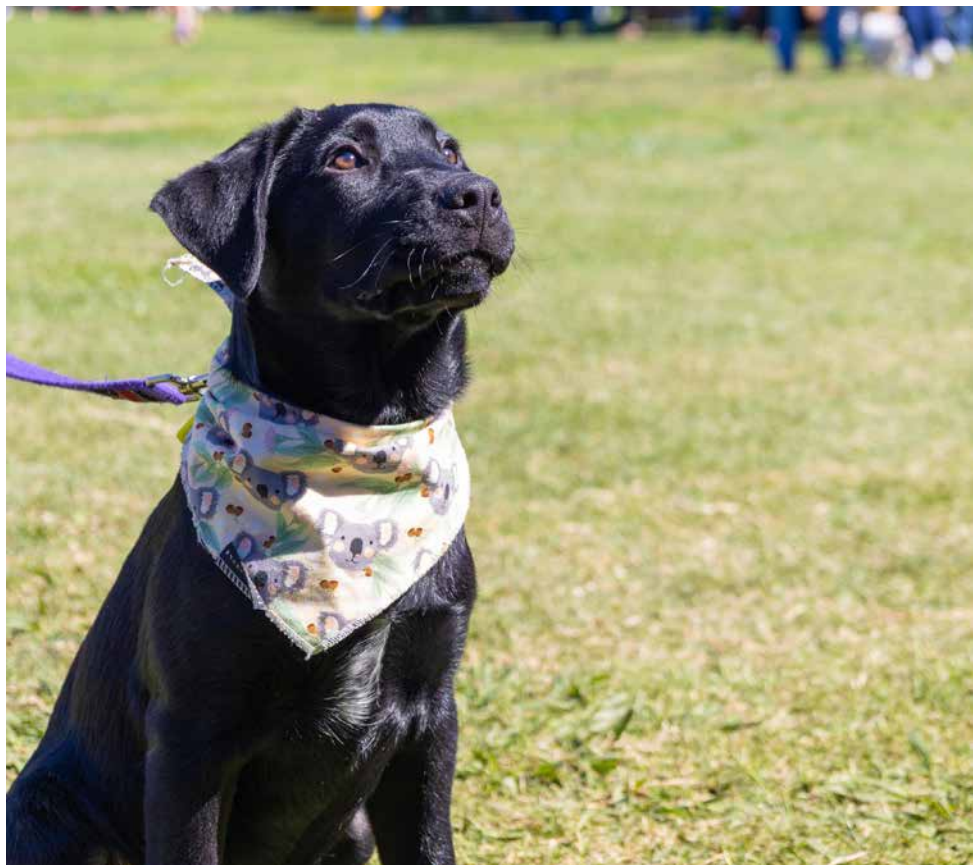
From the 2025 Baw Baw Shire Pet Expo.

To view available cats and learn more about the adoption process, please visit www.bawbawshire.vic.gov.au/Animals .