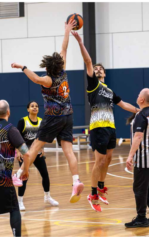
The Deadly Hoops Basketball featured kids and community games.