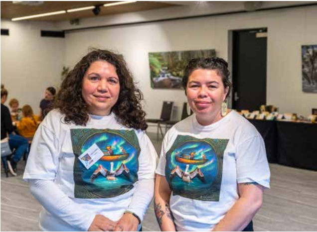
Volunteers at the expo.