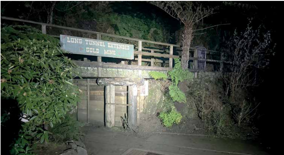
The entrance to the mine shaft.