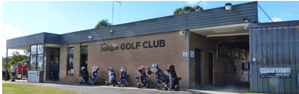
The Trafalgar Golf Club.