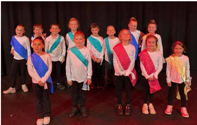
Grade 1/2 students performed on the stage.