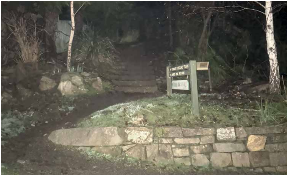
A trail off of Main Road.