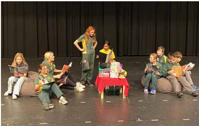
Senior students led the concert as the family members.