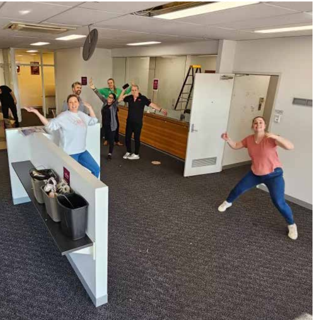
Staff at the branch the day before renovations began. Image supplied.