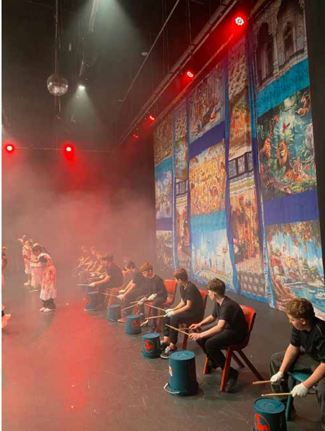
A sneak peek of the production impact.