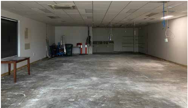
The branch is under renovation. Image supplied.