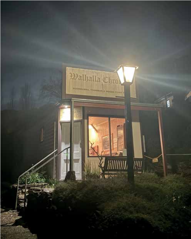
The starting place for the tour: The old office for the Walhalla Chronicle, the town's newspaper established in 1889.

If you are fascinated by the paranormal or are planning to spend some time in Walhalla, this is a great way to spend an evening.