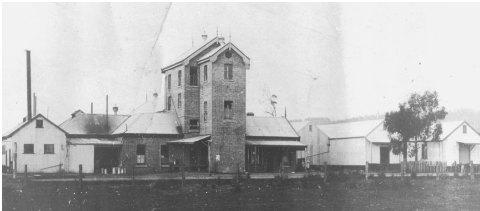
Second Trafalgar Butter Factory, built 1904, extended 1910, on Factory Rd.