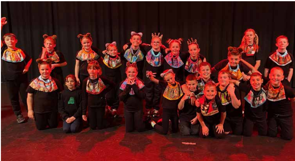
The Grade 3/4 students enjoyed their performance.