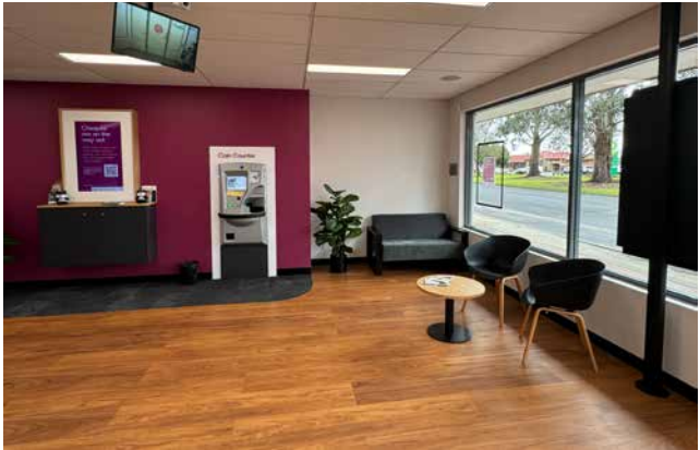
The entrance to the newly refurbished branch.