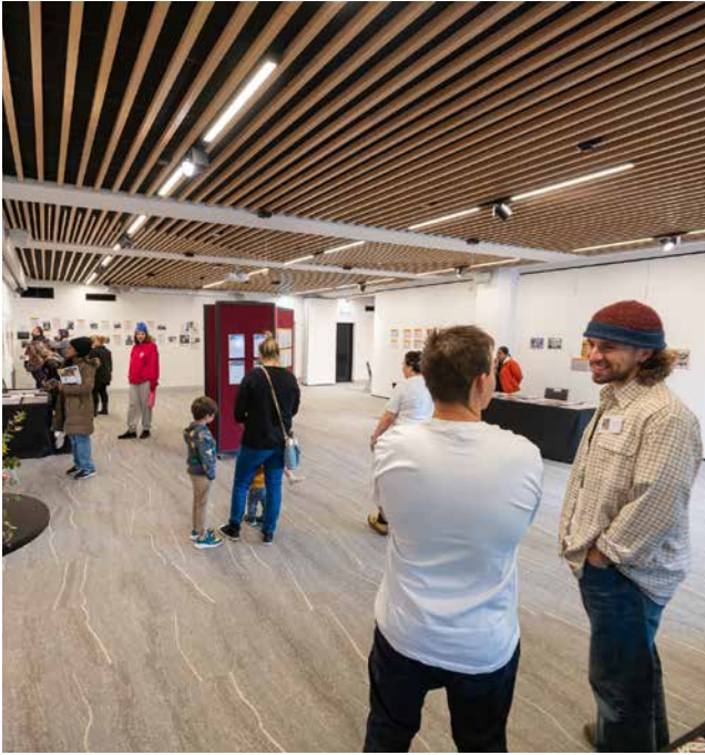
Kurnai Culture Expo at the West Gippsland Arts Centre. All images supplied.

the Warragul Leisure Centre for a deadly game of basketball. Then the Kurnai Culture Expo at the West Gippsland Arts Centre was an amazing opportunity to learn from Kurnai Elders about their culture and history. Historical maps, native ingredients, and Kurnai films were on display.