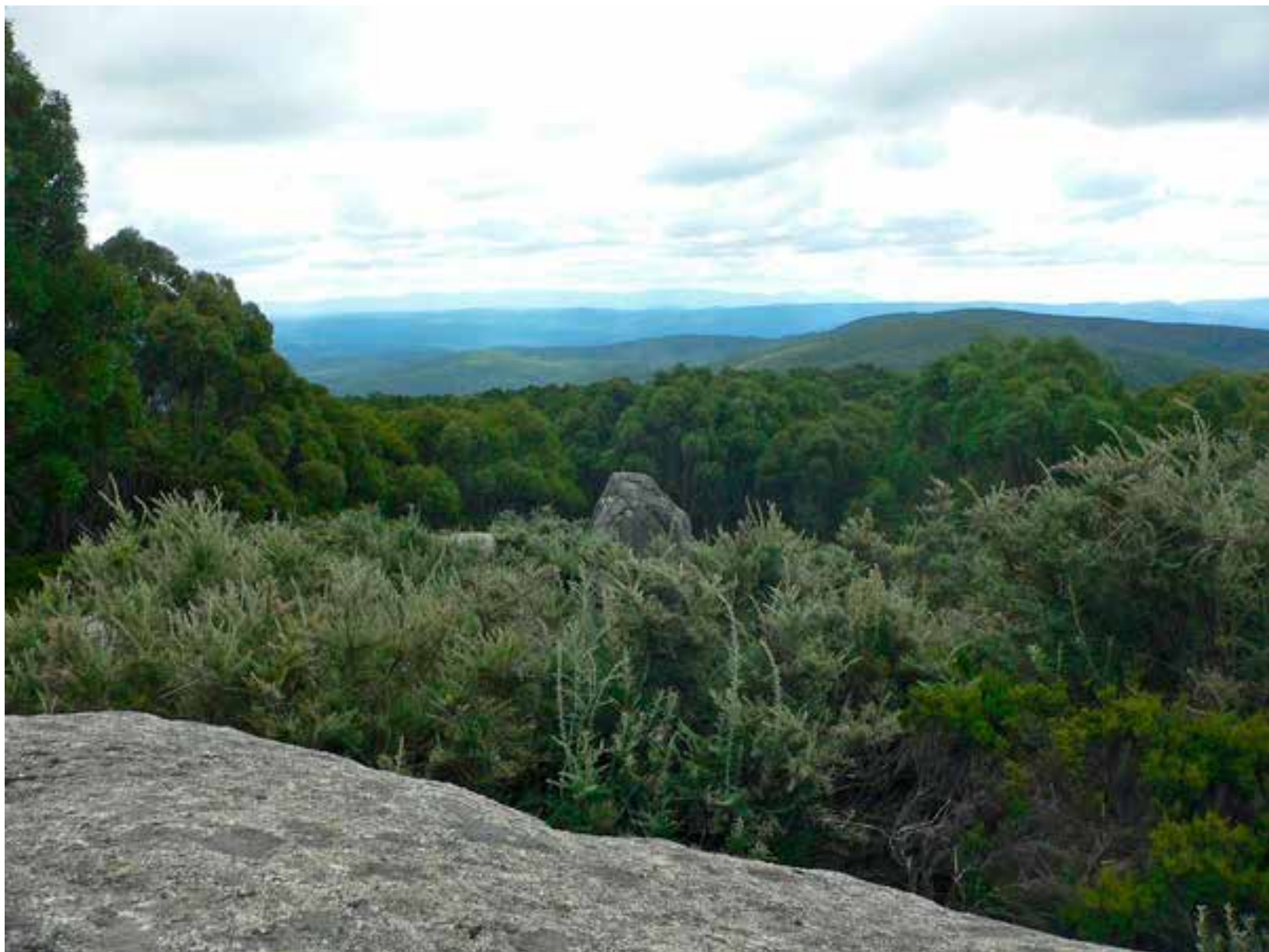
Baw Baw National Park.