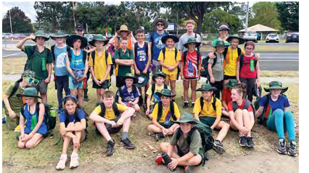
Big kids enjoying the day out