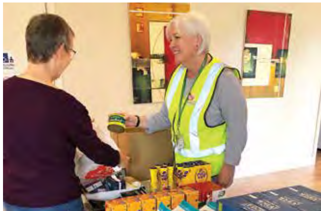
Volunteering with a smile

Baw Baw Food Relief 6/11 Pearse Street, Warragul Ph: 5622 3891 Email: info@bawbawfoodrelief.org