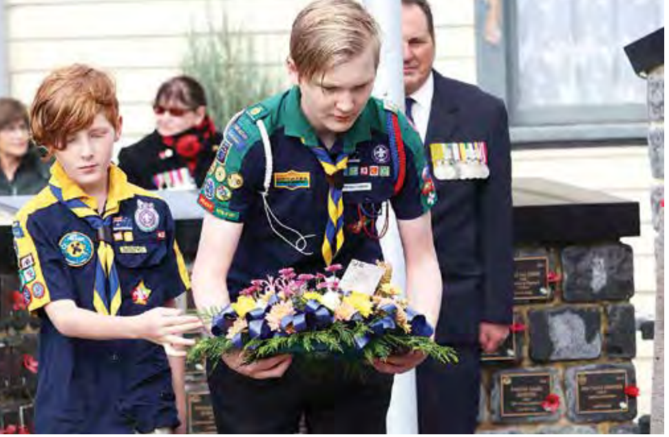
1st Trafalgar Scouts lay a wreath at the Cenotaph