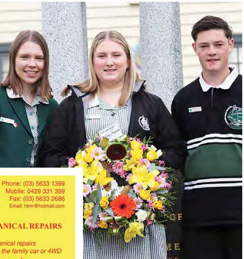
Trafalgar High School captains at Trafalgar ANZAC Day March & service