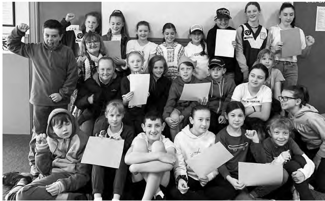
Students participating in Do It For Dolly day