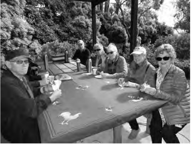
Leisurely walk through Thorpdale

We have welcomed some more new members. Anyone is welcome on any Monday and Wednesday for an inspection of our shed and have a cuppa and chat at Wellington St Trafalgar.