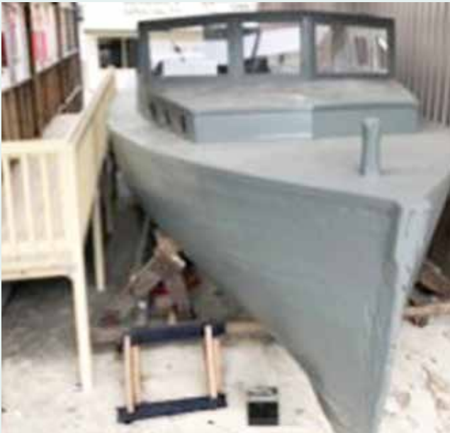
Trafalgar Holden Museum displaying boat with their new walkway

Trafalgar Holden Museum is greatly appreciative of the grant provided by Public Record Office Victoria's Local History Grants Program, as without that grant, the restoration of the boat could not have occurred.