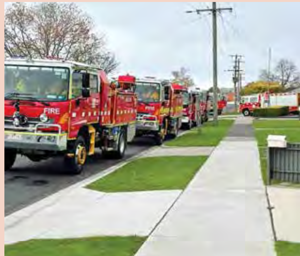
Fire trucks lined up at the station in Trafalgar, in front of the fire station

skills, to help better protect the community.