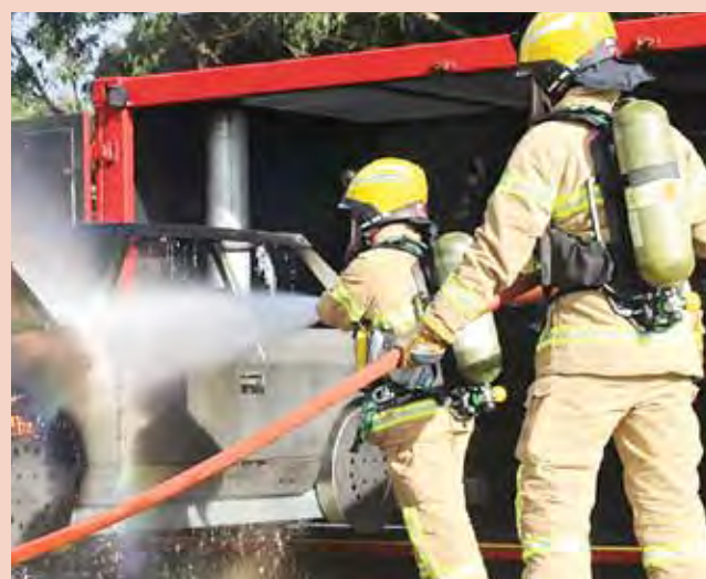
The car prop simulator, used to hone in on non-structure fire skills