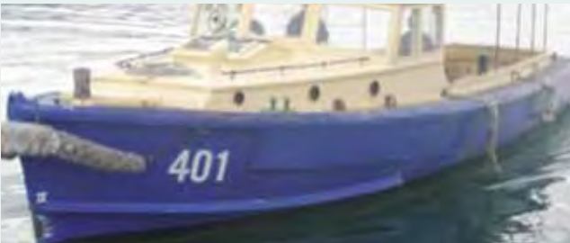
What the boat originally looks like

but with production problems, none of these engines were installed in the boats before the end of the war.