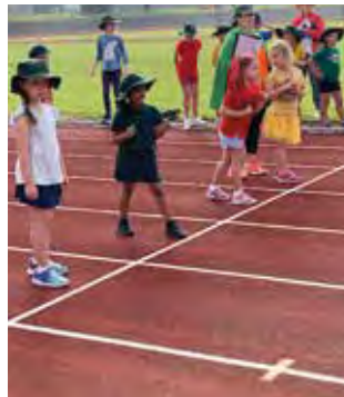
Grade 1 girls

The day was a huge success and the students all had a wonderful time. It was terrific to see many ribbons to acknowledge the children's achievement and effort and big smiles all around.