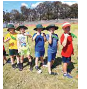
Grade 2 boys