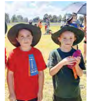
Grade 2 girls