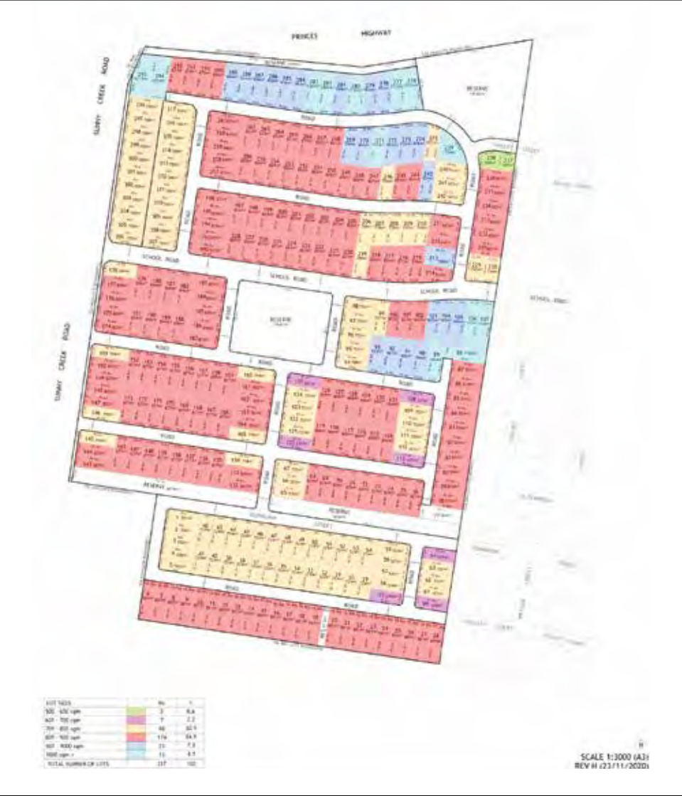
Development plan showing 317 lots of Jim Parise's farm

It is time for us to again take that lead.