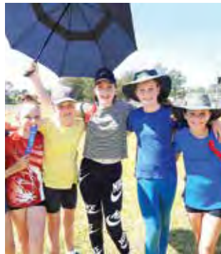
Showing off their ribbons