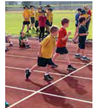
Grade 1 boys