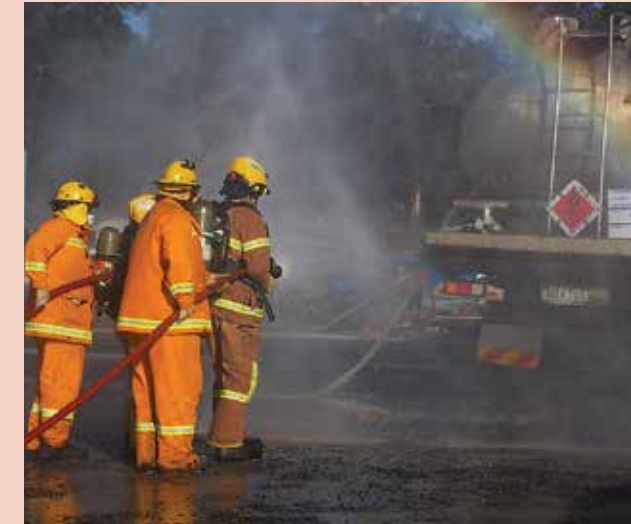
A hazardous materials exercise was run, with use of a tanker truck – photo by Dave Blacker, Noojee Fire Brigade