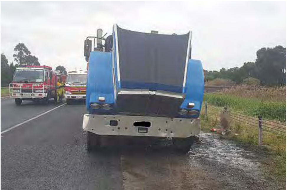
Trafalgar fire trucks on the highway next to the truck that was on fire

The cause of the fire is believed to have been a mechanical fault.