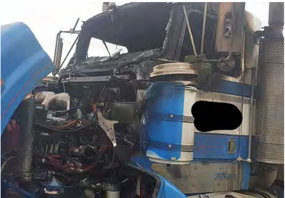
A quick response time contained the fire predominantly to the engine bay and the drivers cabin