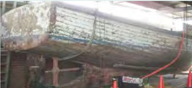
Boat on arrival to museum hanging from the roof beams

With the threat of invasion of Australia over, 114 bhp Cadillac petrol engines were fitted in the boats and as well the straight eight Chrysler Royal petrol engine but both were prone to fire risk and were less powerful. With no sign that the GMH diesel engine would become available the 500 Gray225 bhp diesel engines was produced in Australia,