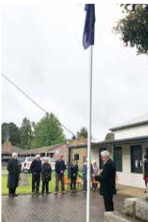
Remembrance Day service in Erica