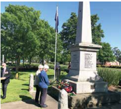
Remembrance Day service in Yarragon