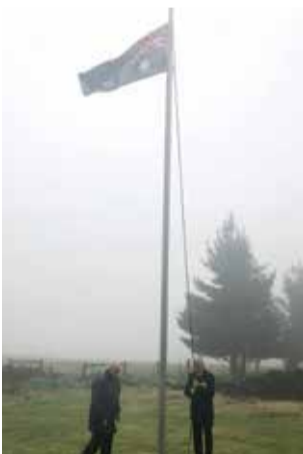
Remembrance Day service in Aberfeldy