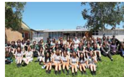
Trafalgar High school year 12 students celebrate their last day.