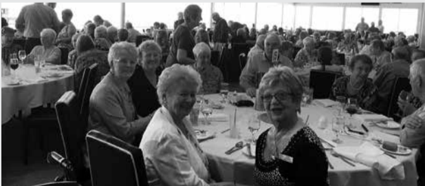
Trafalgar Probus members at Probus annual luncheon 2019-11-16