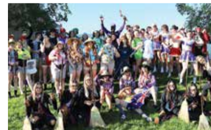
Trafalgar High school students enjoy the chance to dress up on muck up day.

sity, some will travel and others will jump straight into the workforce.