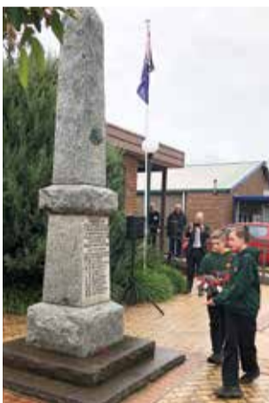
Remembrance Day service in Willow Grove