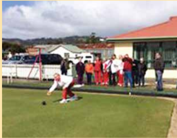
Trafalgar Bowls club

On behalf of the Trafalgar Bowls Club, I would like to thank the Trafalgar community, businesses, clubs and individuals for the support during our recent financial crisis. Without your support this club would not have been able to continue to function. It's great to see community spirit is alive and well in Trafalgar.