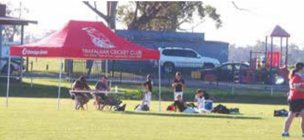
The new Trafalgar Cricket Club marquee has been a great addition.