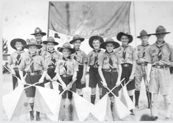
1st Trafalgar Scout Group, date unknown.