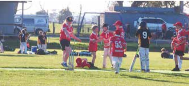
Trafalgar cricket club under 12s celebrate a wicket.