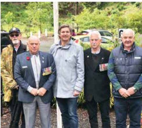
Remembrance Day service in Wallballa